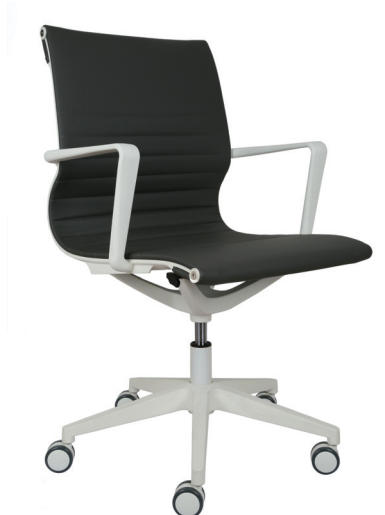
Buro Diablo PU (Grey with white frame)