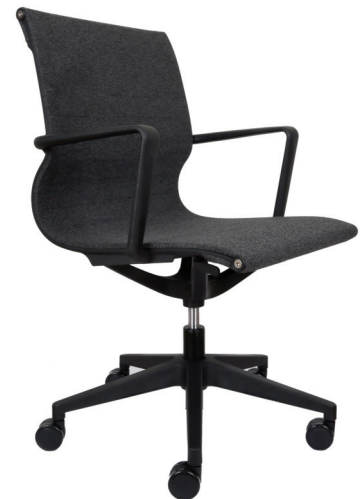
Buro Diablo Fabric Mesh (Charcoal)