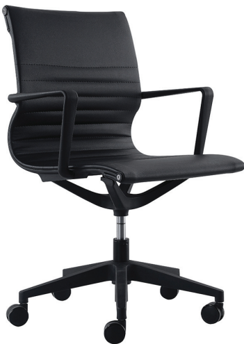
Buro Diablo PU (Black)