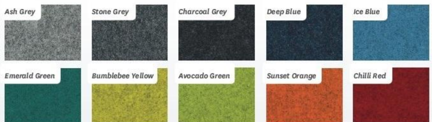
FELT SEAT COVER COLOUR OPTIONS

Seat height: 510-600mm Seat width: 510mm Seat depth: 465mm Overall height: 975-1070mm