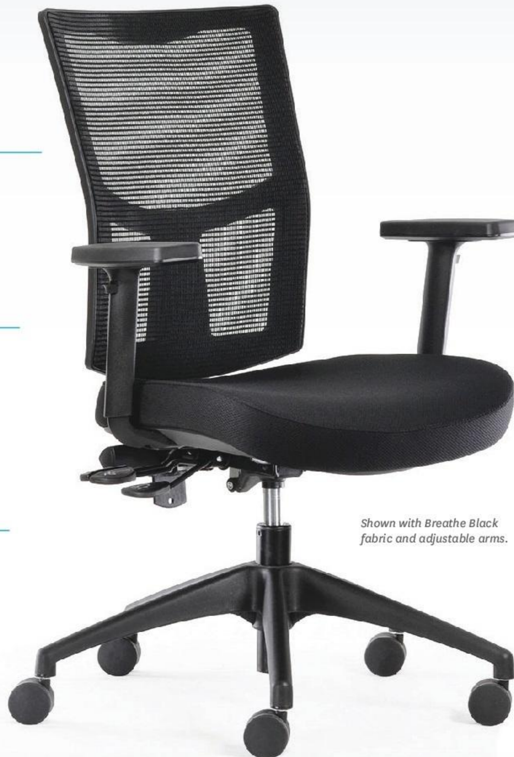
Shown with Breathe Black fabric and adjustable arms.

Stylish BLACK NYLON star base, optional alloy base available.